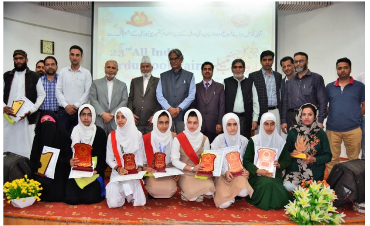
23 Kul Hind Urdu Kitab Mela

NCPUL promotes Urdu books through Sales and Exhibitions across the country. After the grand success of 22 Kul Hind Urdu Kitab Melas at different places like Delhi (4), Mumbai (4), Hyderabad (3), Lucknow (2), Aurangabad (1), Srinagar (2), Kolkata, Patna, Malegaon, Bhiwandi, Solapur and Kishanganj (one of each destination) respectively. Council organised 23 rd Kul Hind Urdu Kitab Mela at Srinagar from 15 to 23 June, 2019. Council also participated in World Book Fair organized by UAE Government at Exhibition Centre, Abu Dhabi, UAE from 24 th to 30 th April, 2019. (Council organized three Regional Kitab Melas at Guwahati, Delhi and Malegaon in past also).