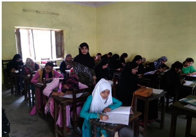
Urdu Study Centre

To fulfil the requirement of a large number of learners across the country and popularize Urdu language and its script across the country, the Council has launched one year Diploma in Urdu course through Hindi and English mediums. This course has received an overwhelming response throughout the country. 'Urdu Online Learning Programme' launched wherein at present 32426 learners consisting 29528 Indians and 2898 foreigners registered.