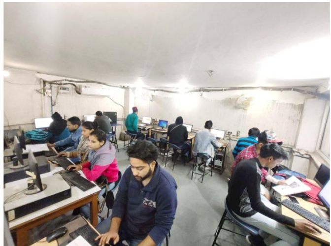
Students of CABA MDTP Centre

Transfer of information technology to language and making Urdu speaking boys' and girls' part of employable technological work force of India, the Council establishes Computer Applications, Business Accounting and Multilingual DTP Centres (CABA MDTP) across the country. The course has recognition from National Skill Development Agency, Ministry of Skill Development and Entrepreneurship, Govt. of India. Till date 241693 students including 101072 girls have been awarded Diploma under this Scheme.