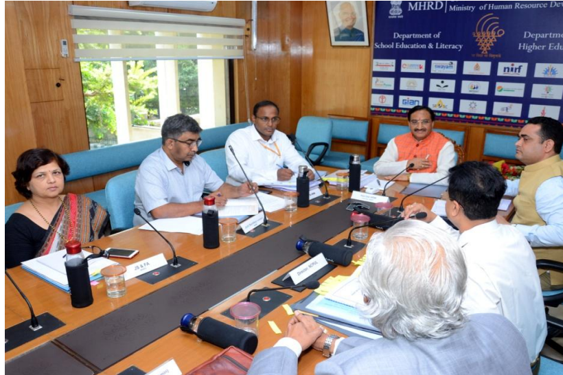
Meeting of the Executive Board Chaired by Hon'ble HRM

To gear up the academic and administrative operations and bring these in line with the objectives as mentioned in the Memorandum of Association, various statutory bodies of NCPUL had their sessions and laid down the working agenda of the Council. During the period from 01.04.2019 to 31.03.2020, no meeting of General Body of the Council held. The two meetings of Executive Board held on 02.05.2019 and 01.10.2019. Two meetings of Finance Committee held on 25.07.2019 and 07.02.2020.