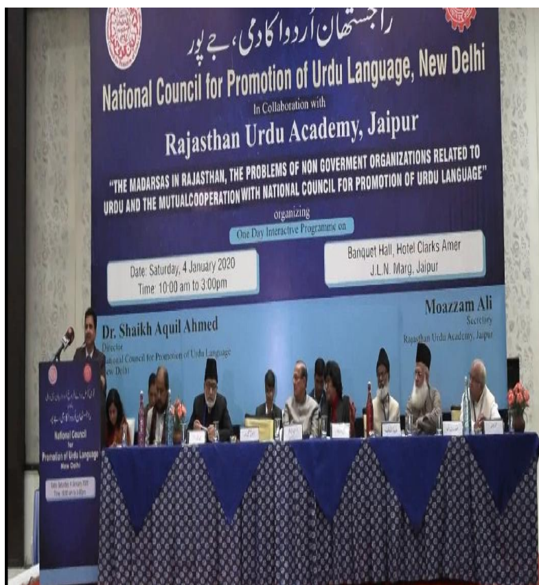
A one-day Interactive Programme at Jaipur in collaboration with Rajasthan Urdu Academy.