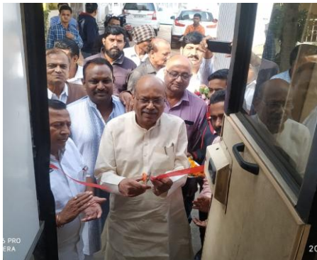
MoS, MHRD inaugurating the mobile van at Akola, Maharashtra