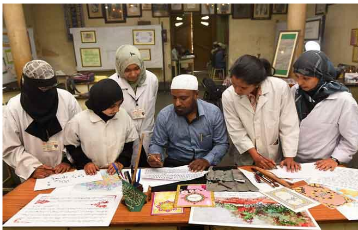
Students of Calligraphy & Graphic Design Centres

To preserve and promote traditional calligraphy, a rich heritage of India and dovetailing it with the modern graphic design so as employment and entrepreneurship is created, the Council sets up Calligraphy & Graphic Design Centres.